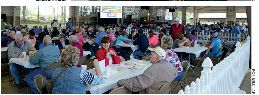
Fest burgers, hot dogs, ice cream and nachos were served throughout the evening at Blue Ridge Fest.