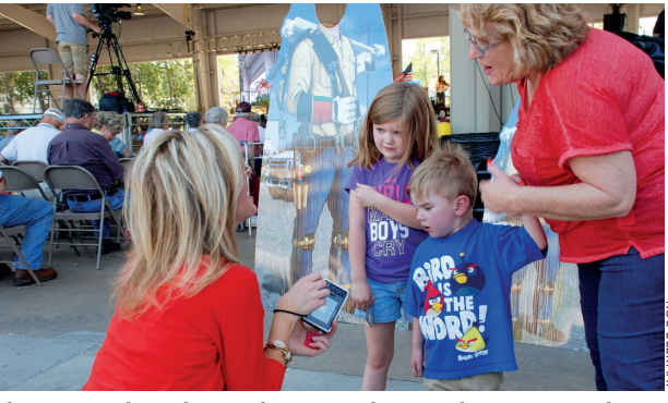
These young Blue Ridge members enjoyed getting their picture made as a lineman. In just 60 seconds they had a photo to remind them of their co-op.