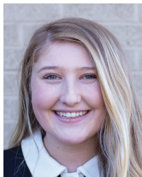
Page Holcombe West-Oak High School