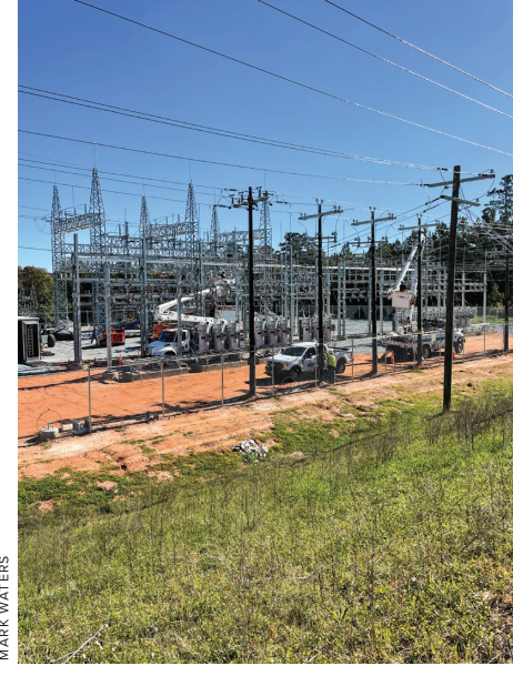
Blue Ridge Electric is constructing a new substation that will serve the western part of Oconee County. The new substation will provide continued reliability

There's no doubt in my mind that our co-op team applies quality to all the work actions I've just described. That resulting no-outage month of April should make all the Blue Ridge family proud.